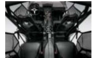
Commander MAX XT Camo