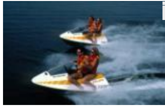
New generation sit-down Sea-Doo PWC