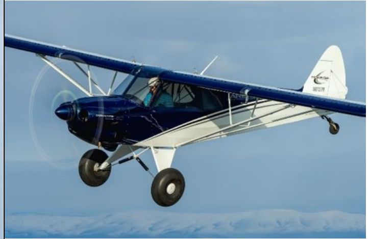
New Rotax 916iS/c powered Carbon Cub UL from CubCrafters.

Lakeland, Florida, March 28, 2023 – BRP-Rotax, a subsidiary of BRP Inc. (TSX:DOO; NASDAQ:DOOO), is proud to achieve a new level of performance with the launch of its Rotax 916iS/c aircraft propulsion system, which makes it perfectly suitable for four-seater planes and for high performance two-seaters. At 85.8 kilograms and a powerful 160 hp, the 916iS/c offers an unprecedented power-to-weight ratio in the light aircraft segment and is available with an impressive 24-volt option for more cockpit features and comfort. The Rotax 916iS/c made its debut today at the SUN 'n FUN Aerospace Expo in Lakeland, Florida, showcasing its power for the first time ever in a CubCrafters aircraft, a new customer of BRP-Rotax.