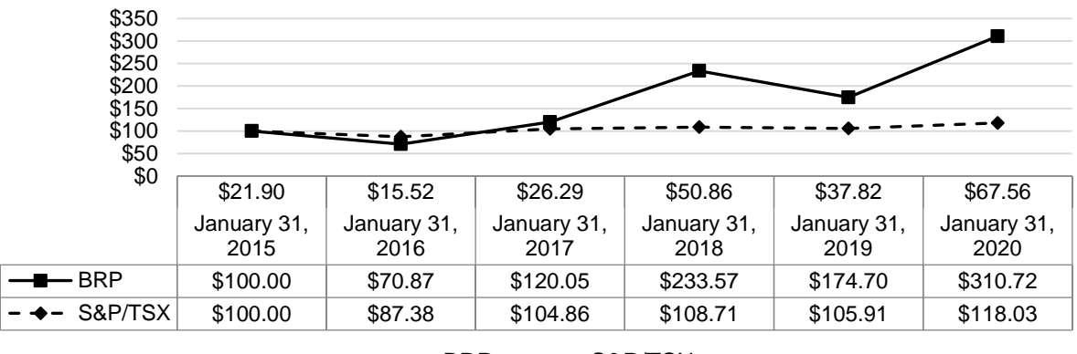
BRP - ← S&P/TSX

The following performance graph illustrates the cumulative return on a $100 investment in the Subordinate Voting Shares, with dividend reinvestments, compared to the cumulative return on the S&P/TSX Composite Index for the five-year period commencing on February 1, 2014 and ending on January 31, 2020, being the last trading day of Fiscal 2020.