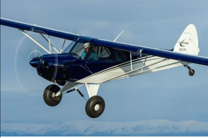
New Rotax 916iS/c aircraft propulsion system.